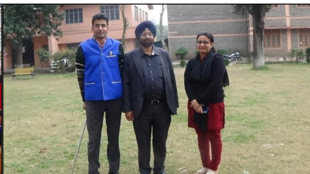
Principal, NSS Officer, Coordinator “UDAAN”